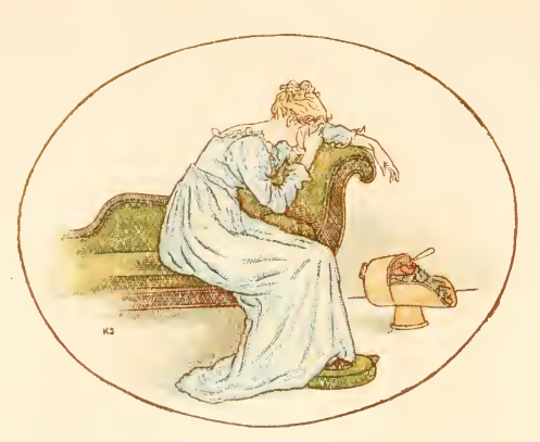
Yew . . . . Sorrow